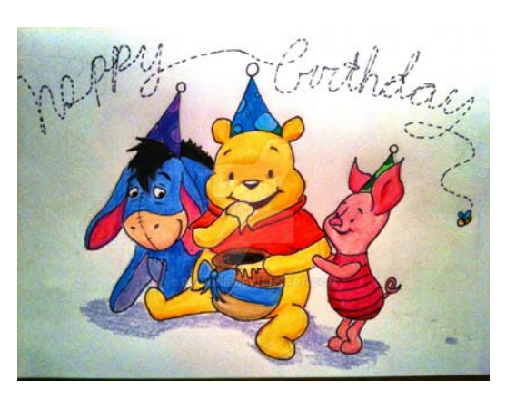
Happy Birthday to us!

HT Rotary celebrates its 18th birthday on Wednesday!